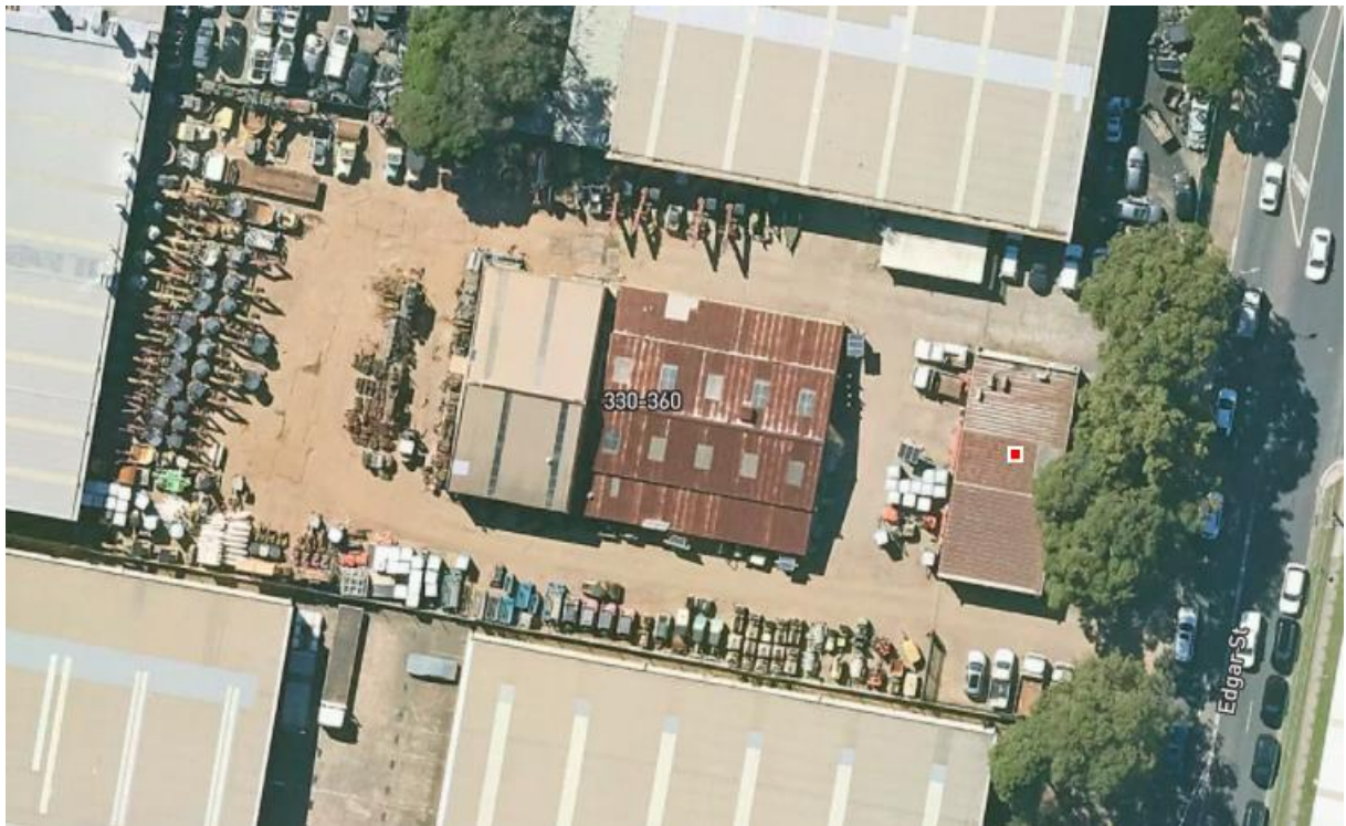
Figure 1: The subject site located by red marker (metromap 2024).